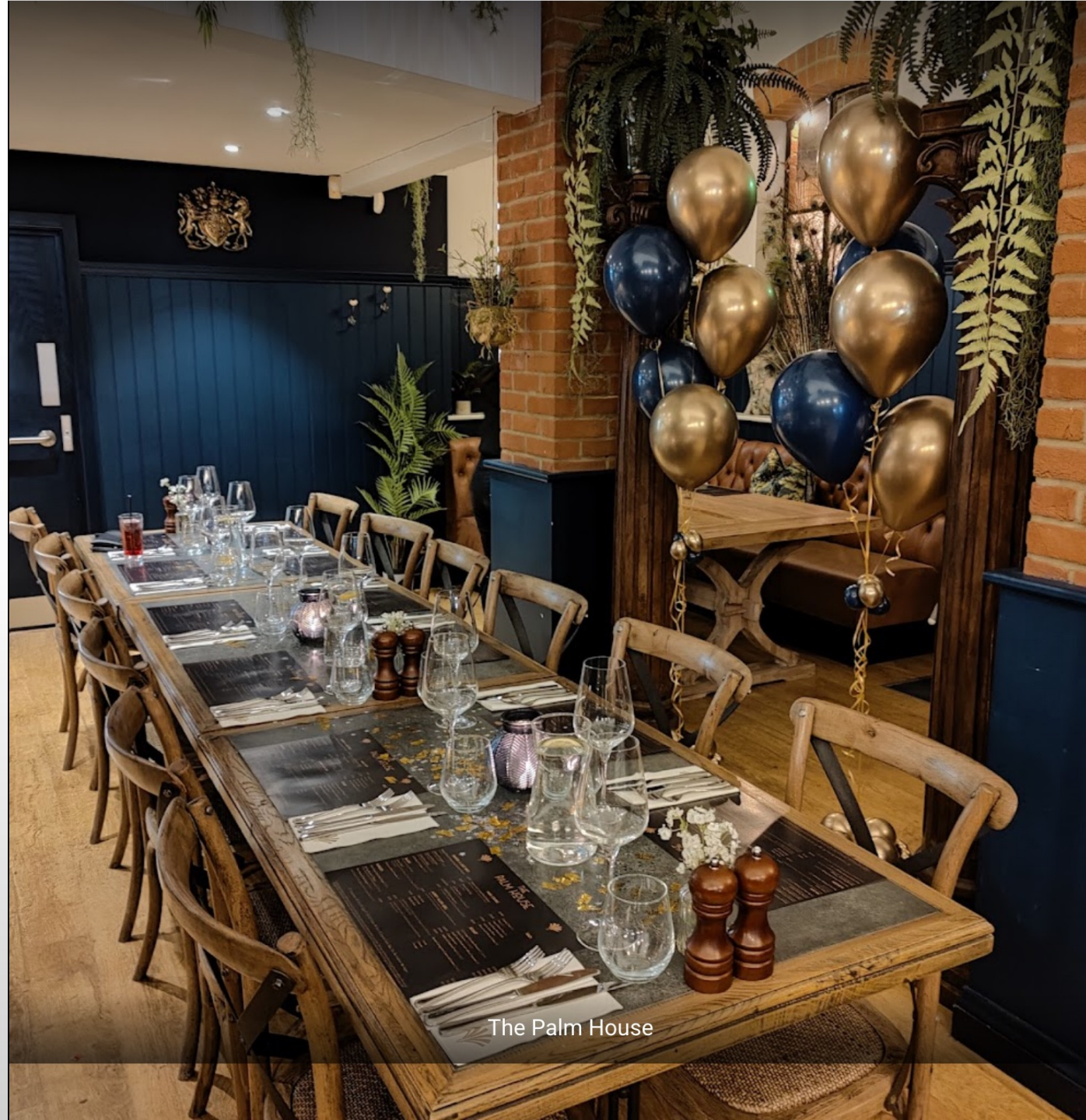
The Palm House